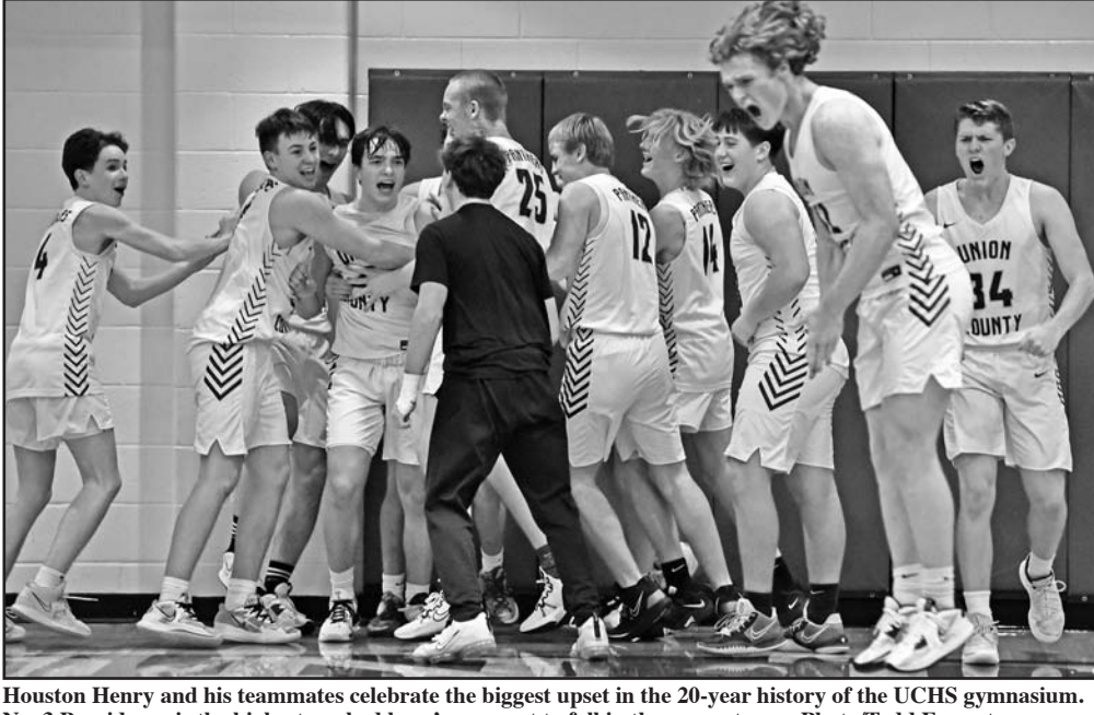
No. 3 Providence is the highest-ranked boys' opponent to fall in the current gym. peak at the right time.

"I think [the team's] turning point came when everyone started to find, not necessarily layup tied things up at 68-68 until their own individual game, but