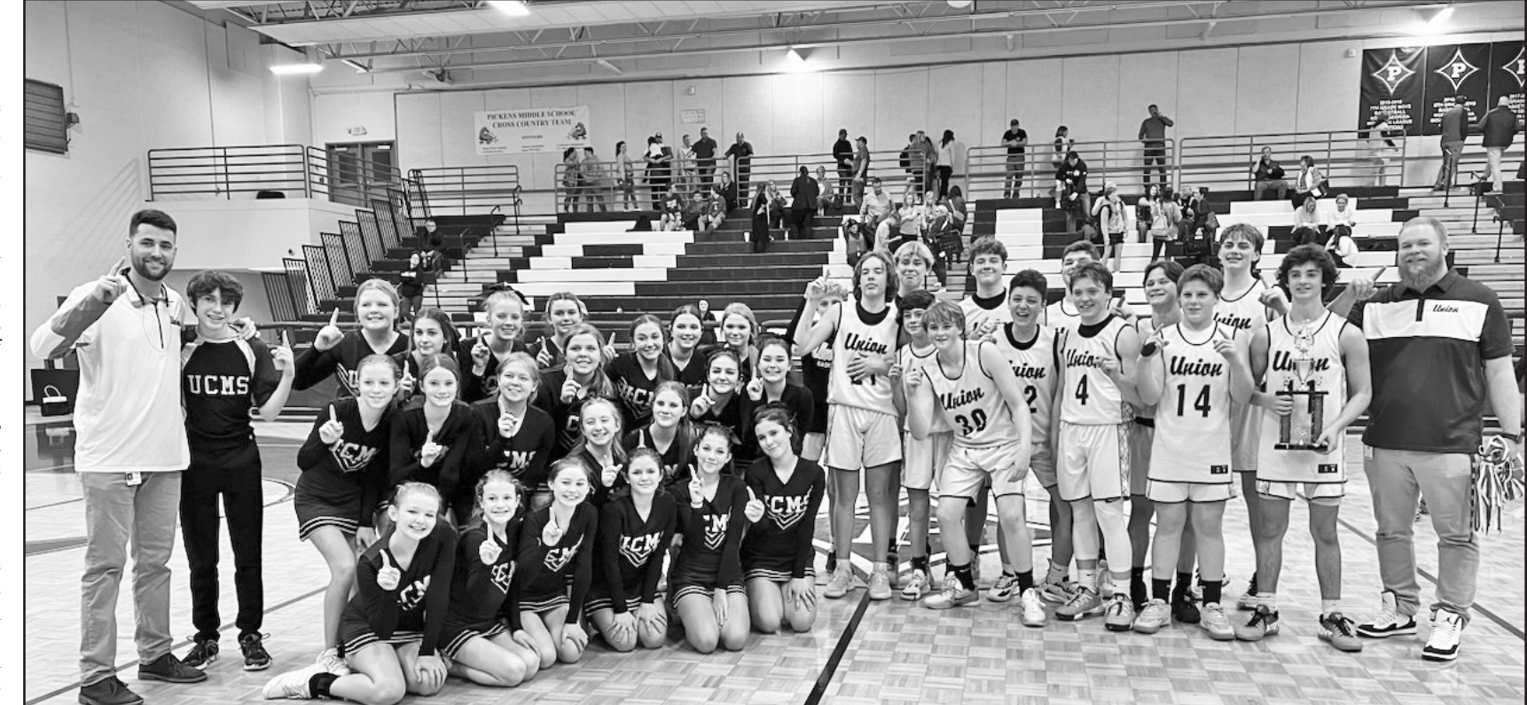
Alongside the cheer squad, the Union County Middle School's 8th grade boys' basketball team celebrates a perfect season following their 57-55 victory over Fannin County in last Thurs-